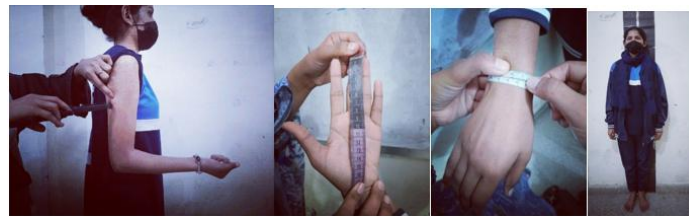
Figure 1 Measurements of skinfold (Lohman & Pollock, 2013).

Wrist girth: measurement of the distance around the wrist. Note the measurements where the tape meets itself (Lohman & Pollock, 2013). Forearm girth: The maximum girth of the lower arm. Which is estimated to be 6 centimeters laterally from the radial. The subject was instructed to stand in a relaxed position. Hold the tape securely and take measurements in centimeters where the end of the tape meets the other part of the tape (Daniell et al., 2012). Chest girth: this measure was taken at the level of the middle of the sternum (breastbone), with the tape passing under the arm (Haq et al., 2019). The researcher read the measurements at the point where the measuring tape meets itself (Pluta et al., 2021). Calf girth: the maximum girth or distance around the calf muscle of the lower leg. Measuring tape should not push the calf muscles, just lightly touch the skin of the subject. The researcher read the measurement where the tape was met (Mohadjer et al., 1996).