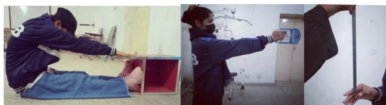
Figure 2 Flexibility Sit and Reach Test (Picabea et al., 2021)

The quickest value was used for the statistical analysis after this test was run three times with a three-minute gap between measurements. The test's closest measurement was 0.01 seconds. The T-Test is an athletic mobility test that includes backward, sideways, and forward motions. The subjects were asked to put the horizontal line on the wall at a 90-degree angle from the floor. Face the wall, feet are on the floor and the subject's arms extended above her head. Where the fingertip touched the wall, it put a mark. The length of the jump was measured from